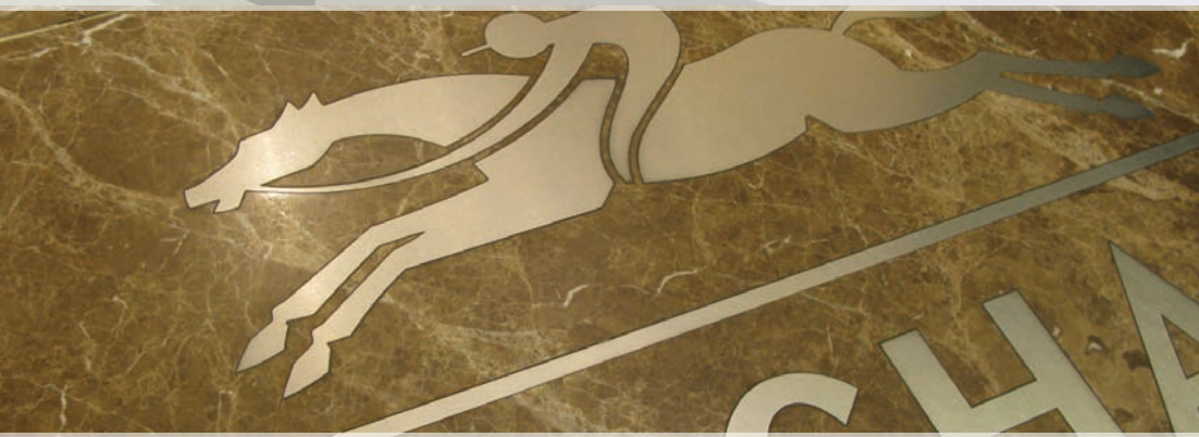
INLAY FLOOR LOGOS