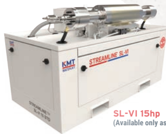
SL-VI 15hp (Available only as shown)