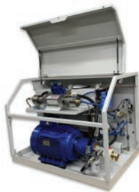
Removeable Magnetic Doors For Faster Maintenance